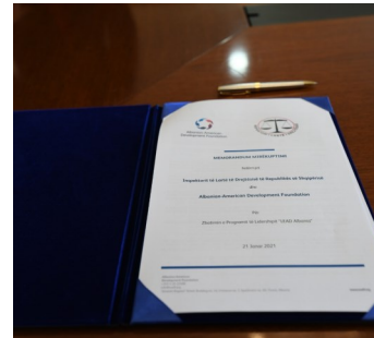
Memorandum of Understanding

A memorandum of understanding was signed today between the High Inspector of Justice Office and the Albanian-American Development Foundation (AADF) for the Leadership Development Program, LEAD Albania. This program aims to provide young and talented Albanian professionals with direct experiences in the process of governing Albania.