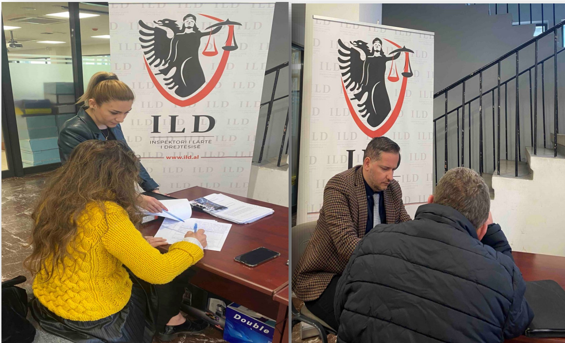
While assisting the complainants

The team of complaints office welcomes citizens-complainants every working day from 09:00 am to 02:00 pm, while for increased communication with interested citizens, in