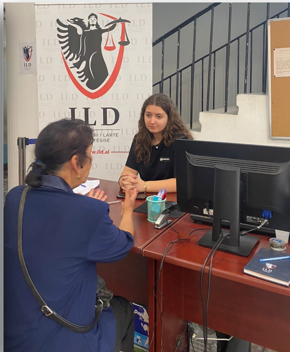
While assisting the complainants

The team of complaints office welcomes citizens-complainants every working day from 09:00 am to 02:00 pm, while for increased communication with interested citizens, in addition to communication