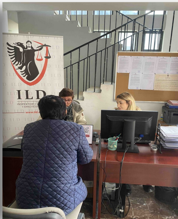
While assisting the complainants

The team of complaints office welcomes citizens-complainants every working day from 09:00 am to 02:00 pm, while for increased communication with interested citizens, in addition to communication through the web-